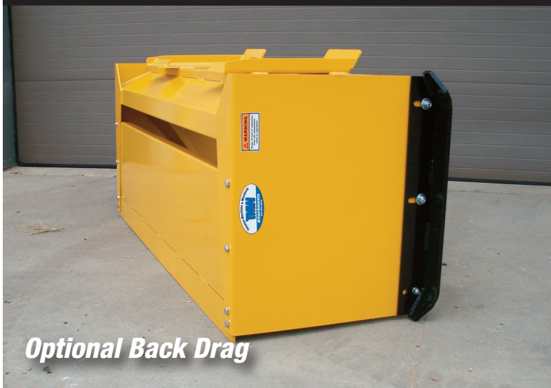
Optional Back Drag