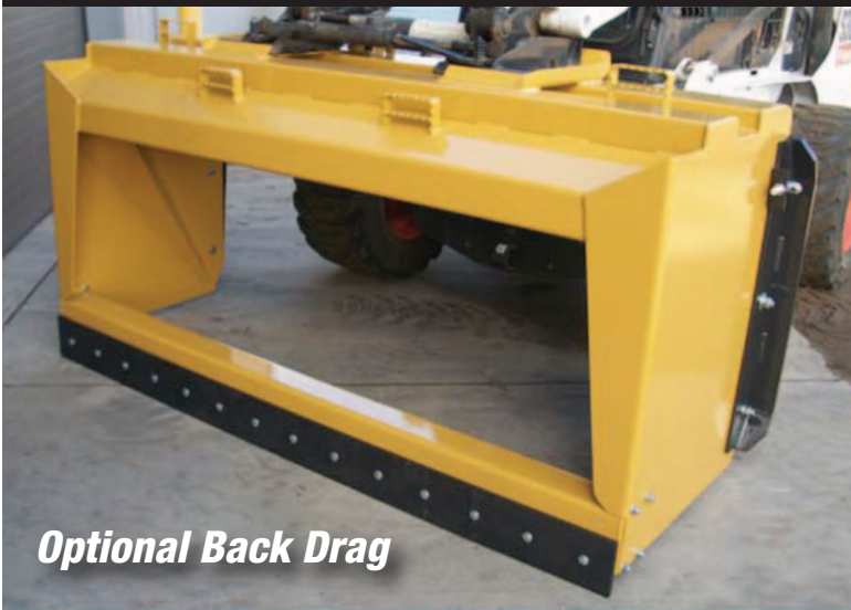
Optional Back Drag