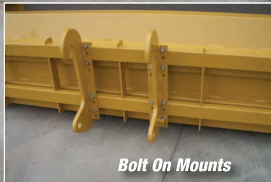
Bolt On Mounts