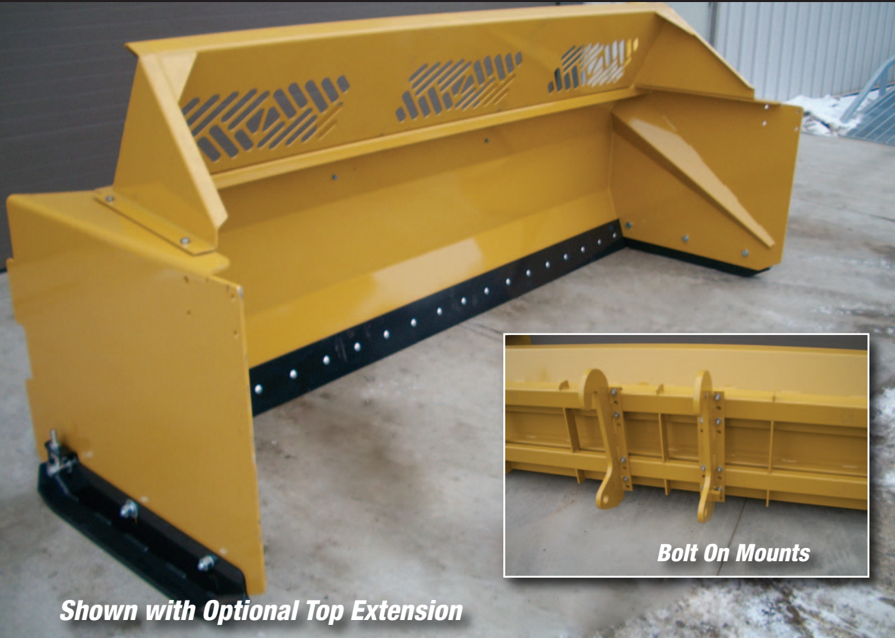
Shown with Optional Top Extension