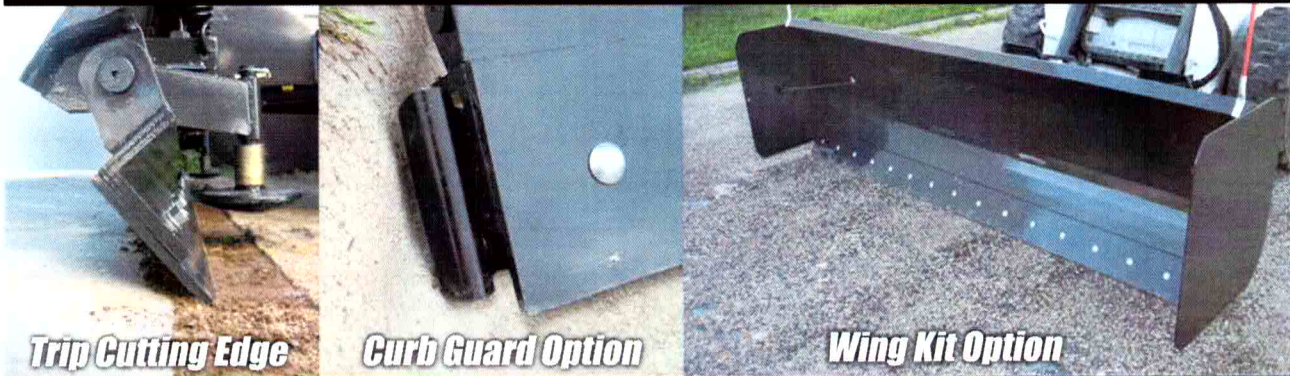
Trip Cutting Edge