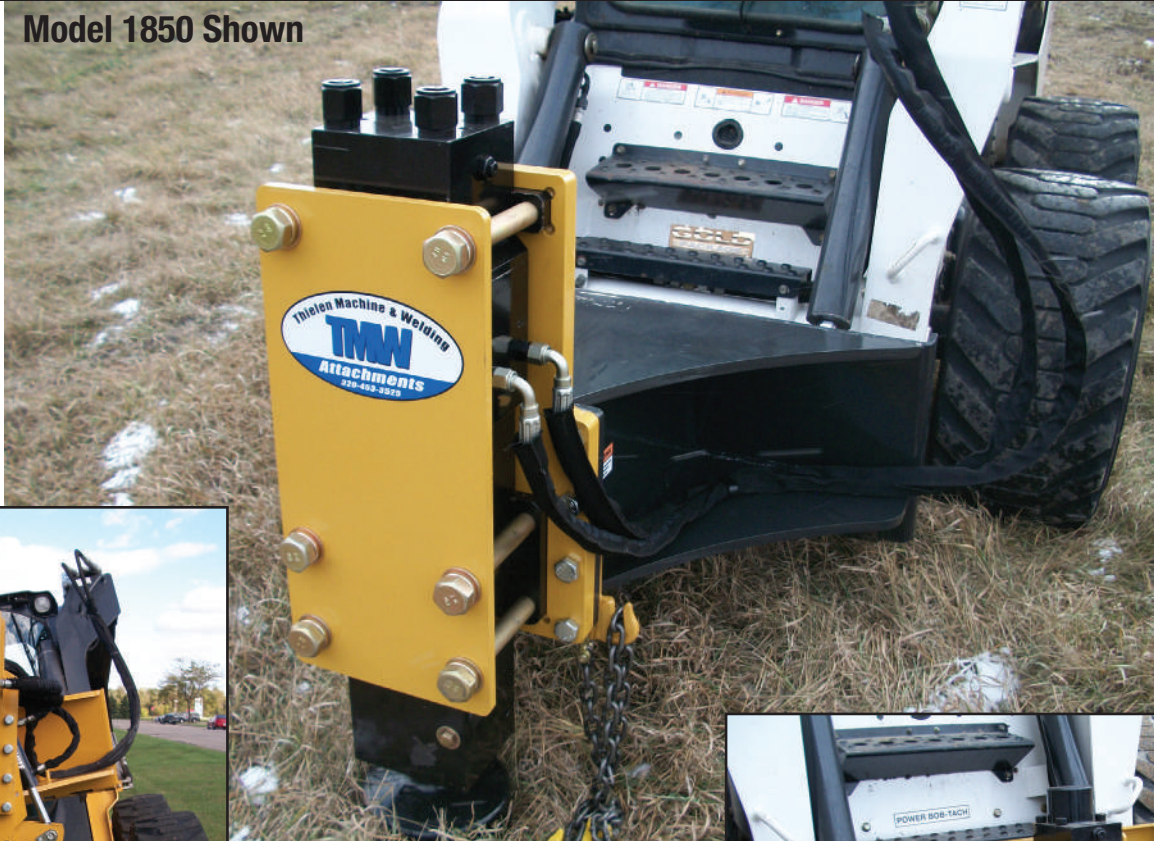
Model 1850 Shown