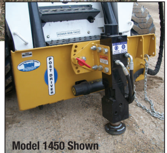
Model 1450 Shown