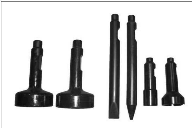
Post Driver Tools